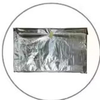
1. Poly bag packing