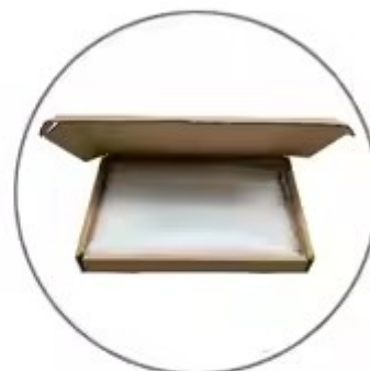
3. Special box