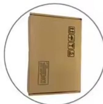
4. Small box packing