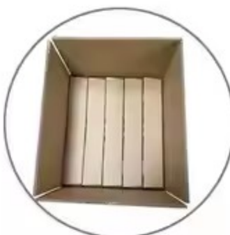
5. Five small box in one big box, double protection