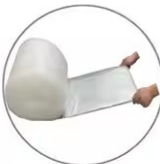
2. Bubble wrap packing