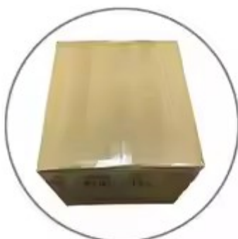
6. Five Layer big box with warning sign